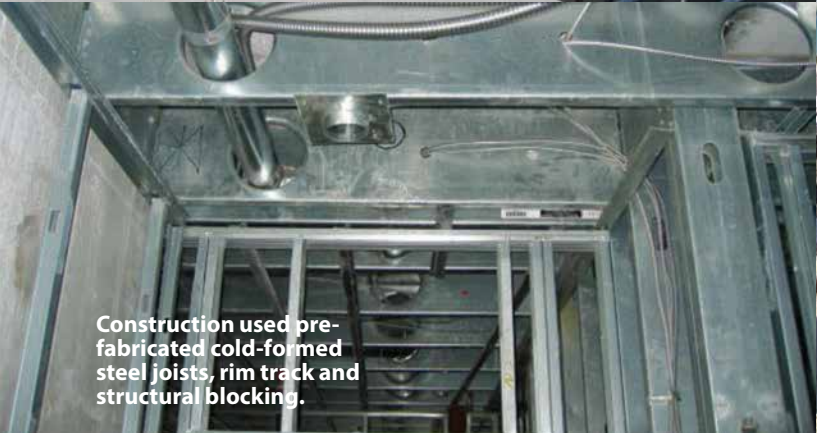
Construction used pre-fabricated cold-formed steel joists, rim track and structural blocking.