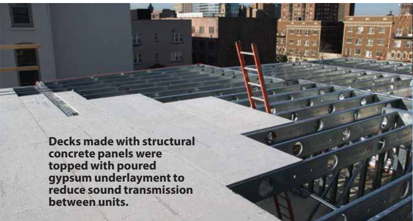
Decks made with structural concrete panels were topped with poured gypsum underlayment to reduce sound transmission between units.