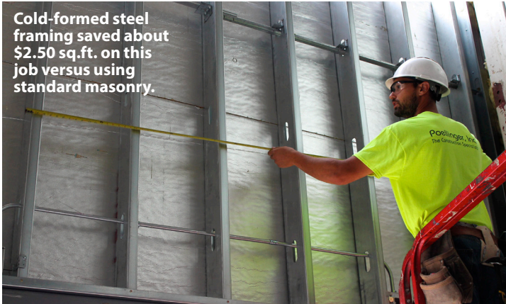
Cold-formed steel framing saved about $2.50 sq.ft. on this job versus using standard masonry.