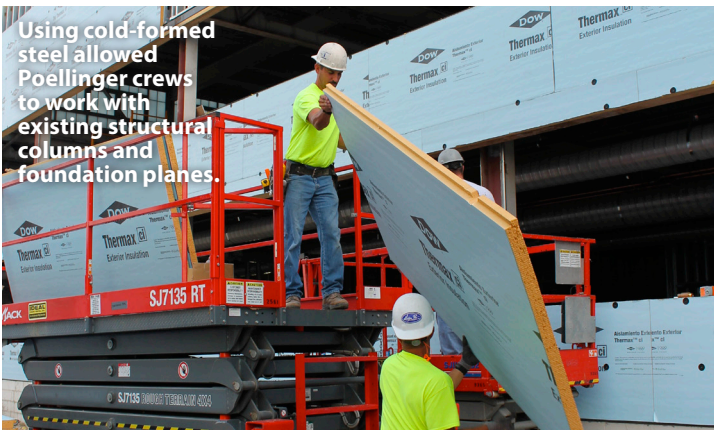
Using cold-formed steel allowed Poellinger crews to work with existing structural columns and foundation planes.

ers that Chart Industries manufacturers at this factory.