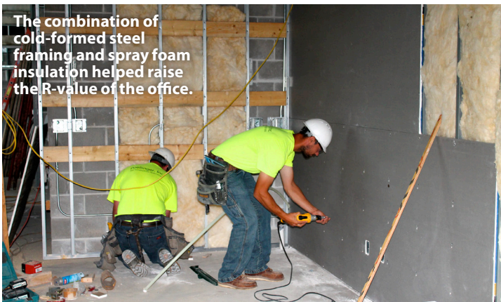
The combination of cold-formed steel framing and spray foam insulation helped raise the R-value of the office.